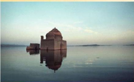
Hindu Temple in Mangla Lake

The city is also blessed with two medical colleges, the Mohtrama Benazir Bhutto Shaheed (MBBS), Medical College in the public sector and Mohi-ud-Din Islamic Medical College in the private sector. The MBBS Medical College has recently been upgraded as MBBS University of Medical Sciences. It also has a number of government and private colleges for boys and girls. In presence of premier academic institutions, the Mirpur is turned into an education city. The city also has a lot of opportunities for business and tourism. Places popular among tourists are Ramkot Fort, Water Sport Club Mangla, Tomb of Piray-Shah-Ghazi besides other nearby important places.